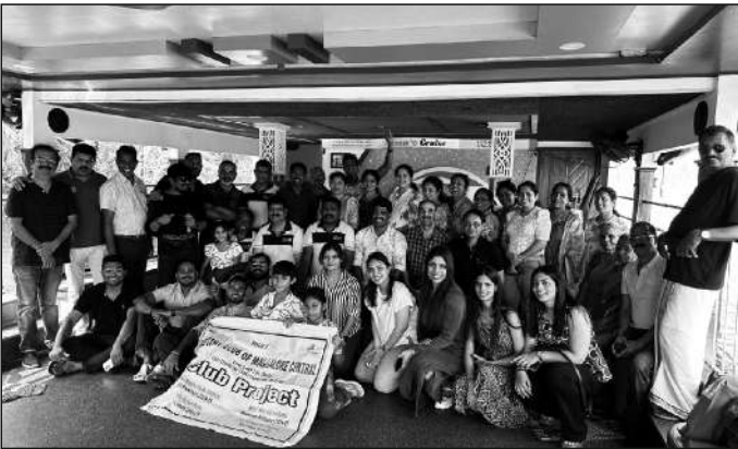
Our Members and their family members seen in the family picnic held at Neeleshwar.