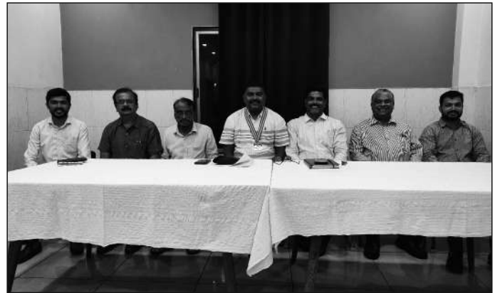
Board Meeting of the Club for February