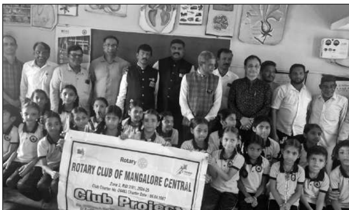
Donation of Water Purification System to DKZP High School Pilikur