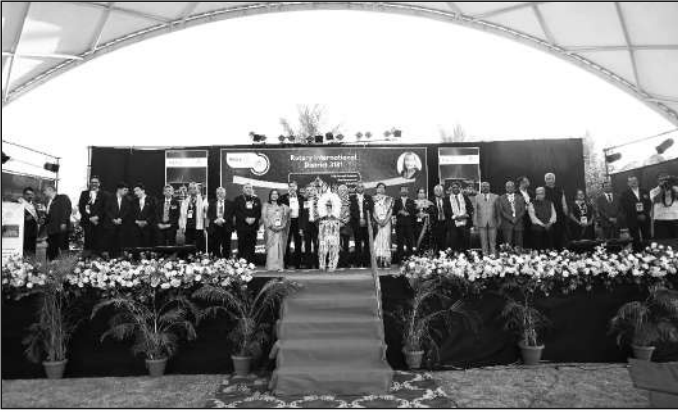
Inauguration of Nava Vaibhava 2024-25