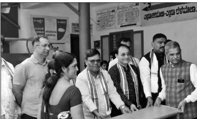
Donation of Furniture to DKZP High School Kotekar